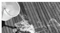
GENTLY WASH DECK WITH WOOD WASH