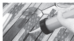
REPLACE CAULKING IN AREAS WHERE NEEDED WITH TEAK JAMMER