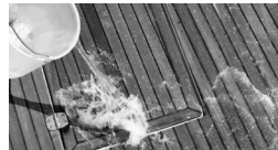
GENTLY WASH DECK WITH WOOD WASH