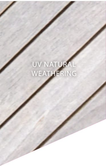
UV NATURAL WEATHERING