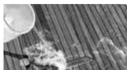
RINSE SURFACE WITH CLEAN WATER