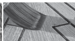
APPLY USING A SOFT NYLON BRISTLE BRUSH